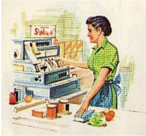
teller or cashier